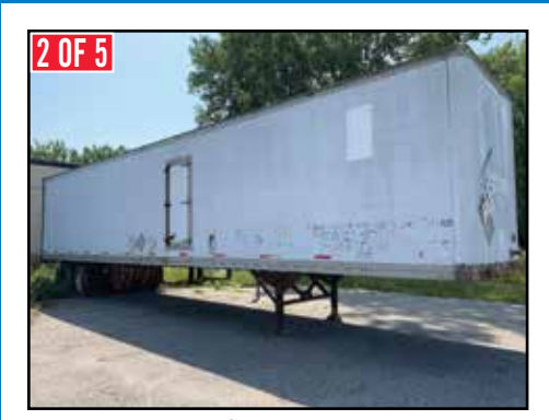
(5) BUDD 53" & 45" and EVANS/MONON Van Body Trailers