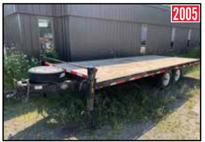
TRAIL KING TK12U T/A Low Boy Trailer