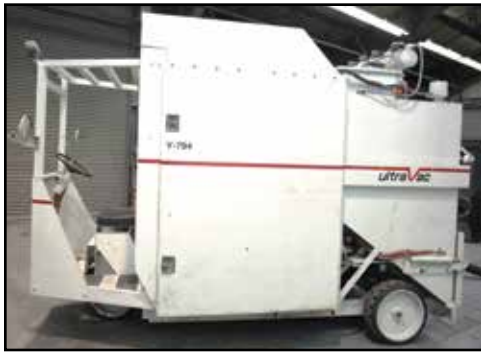
HI-VAC 105S Mobile Vacuum Loader