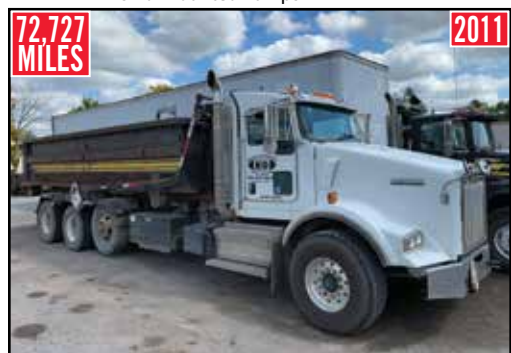
KENWORTH T/A Roll-Off Truck