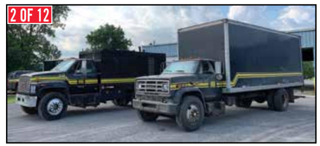
(8) FORD, CHEVROLET & Other Jet Cleaning & (4) GMC Water Blaster Trucks