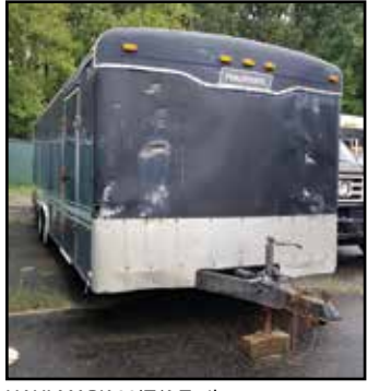
HAULMARK 22'T/A Trailer