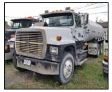
FORD Water Truck