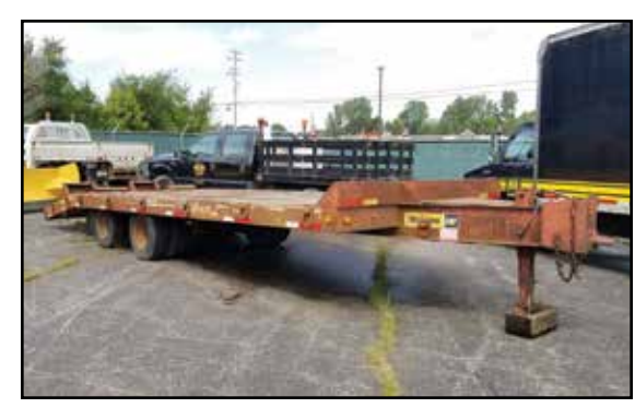
TALBERT T/A Equipment Trailer