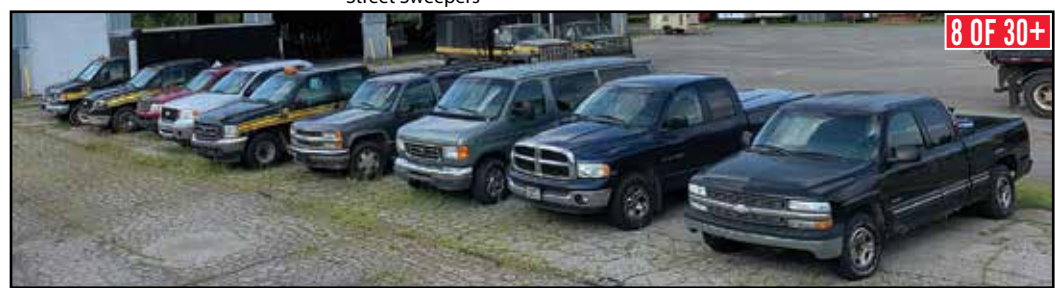
(30+) FORD GMC, CHEVROLET & DODGE Pickup Trucks & Passenger Vans