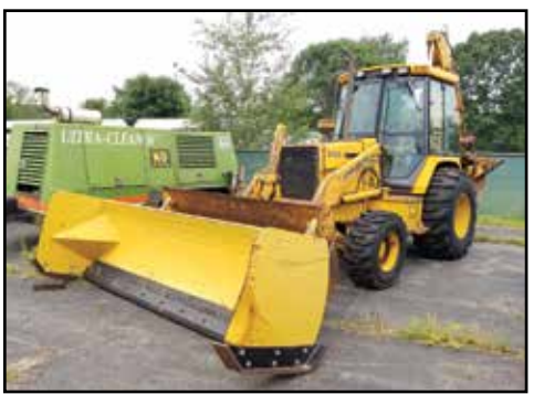
JOHN DEERE 310D Turbo 4X4 Extend-A-Hoe Backhoe