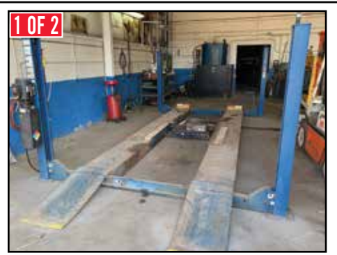
(2) ROTARY 4-Post Vehicle Lifts