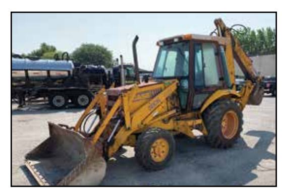
CASE 580K 4WD Backhoe