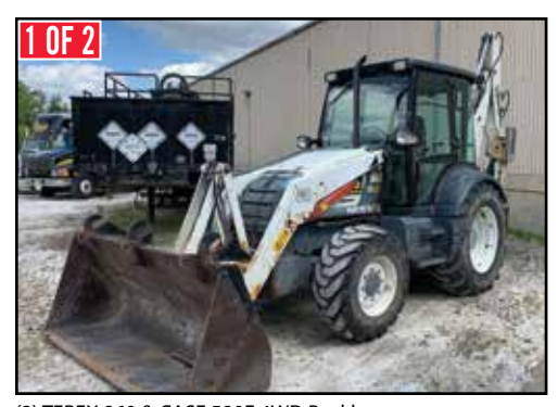
(2) TEREX 860 & CASE 580E 4WD Backhoes