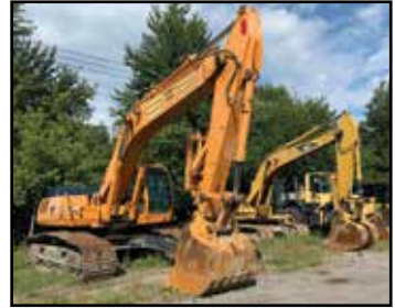
(2) HYUNDAI & CATERPILLAR Excavators