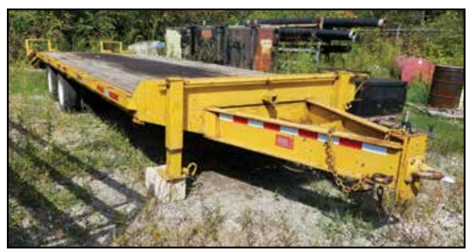
MORITZ 24'T/A Trailer