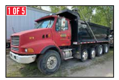
(5) STERLING, INTERNATIONAL & FORD Dump Trucks