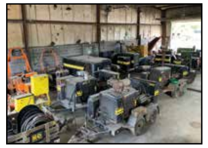
(10+) NLB Trailer-Mounted Water Blasters