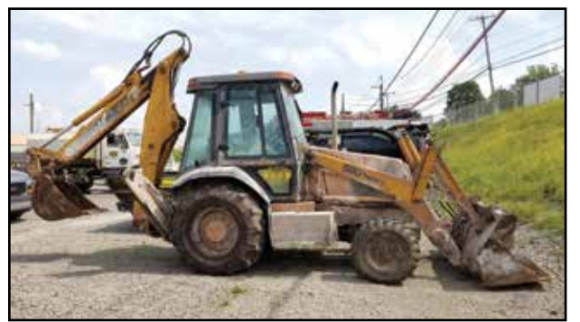
CASE 580 Super L Extend-A-Hoe Backhoe