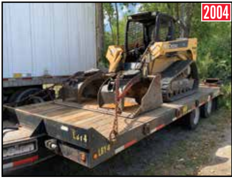
PHELAN 20-Ton Heavy Duty T/A Equipment Trailer