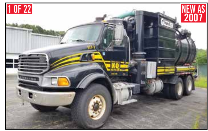
(22) STERLING, FREIGHTLINER, INTERNATIONAL, CHEVROLET, FORD, MARMON & GMC Vacuum Trucks

INSPECTION: DAY PRIOR TO AUCTION FROM 9AM - 4PM