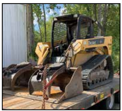
JOHN DEERE CT332 Rubber Track Skid Steer