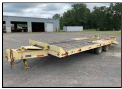
TALBERT TBT-10 Tag Trailer