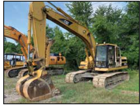
CATERPILLAR 320BL Excavator