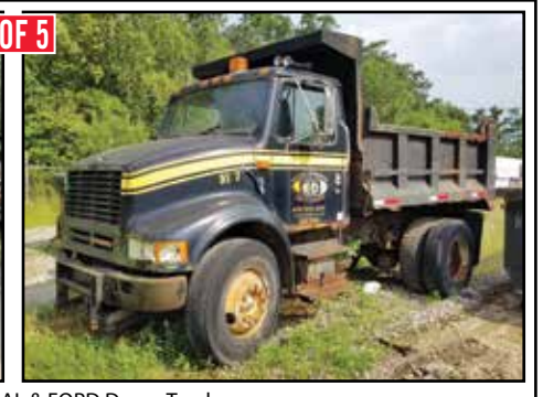
(5) STERLING, INTERNATIONAL & FORD Dump Trucks