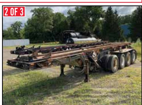
(3) BENLEE T/A Roll-off Trailers