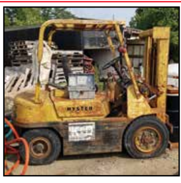
(7) ALLIS CHALMERS, WARNER & SWASEY, NISSAN, TCM & HYSTER FORKLIFTS TO 7,000-lb. Capacity