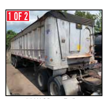
(2) MAC Dump Trailers

1995 FREIGHTLINER FL120, Day Cab, CAT Motor, Hyd. System (MANSFIELD) 1989 KENWORTH T-600 T/A Twin Screw, Sleeper Cab, Wet Kit, Eaton Trans, Cummins Engine (ROMULUS) 1988 KENWORTH T/A, Sleeper Cab (ALLEGEN) INTERNATIONAL Parts Tractor (MAN-