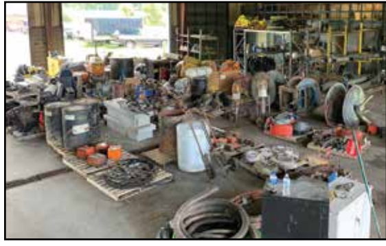
Huge Assortment of Shop & Support Equipment