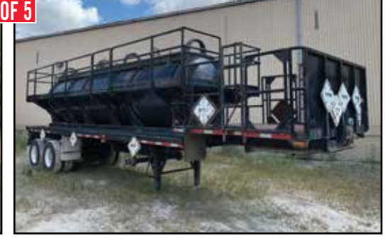
(5) IME, PRESVAC SYSTEMS, INTERNATIONAL. LUBBOCK & Other Tanker Trailers