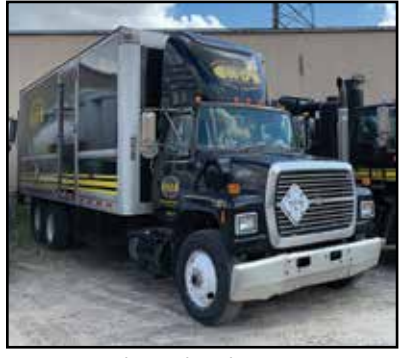
FORD L8000 Chemical Truck