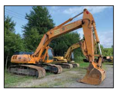
HYUNDAI Robex 360 LC-3 Excavator