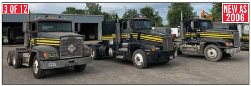
(12) FREIGHTLINER, PETERBILT, KENWORTH, INTERNATIONAL & FORD Truck Tractors